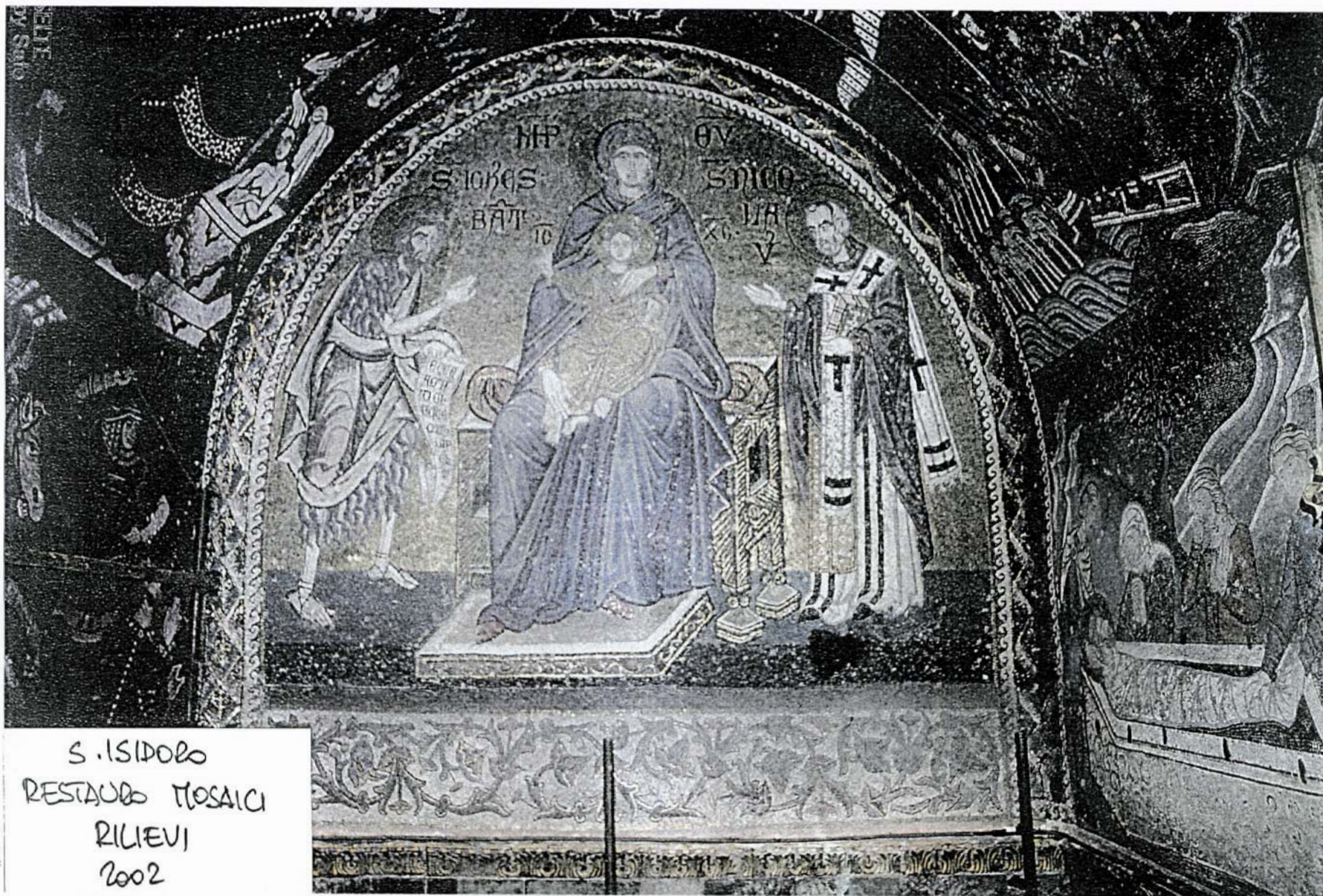
S. ISIDORO RESTAURATO MOSAICI RILIEVI 2002